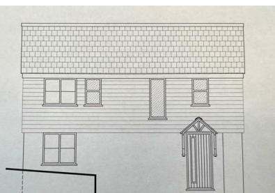
Front elevation (scale 1:100)

Situated in a popular village location and offered with the benefit of no onward chain, this partially built detached house has planning permission granted for two bedrooms with the master having an en-suite and a family bathroom to the first floor plus a lounge/diner, a kitchen and a cloakroom to the ground floor.