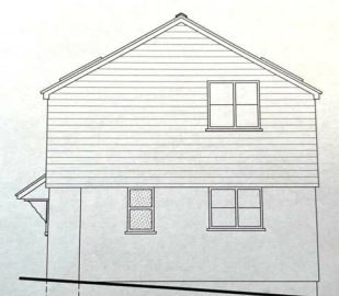
Side elevation (scale 1:100)